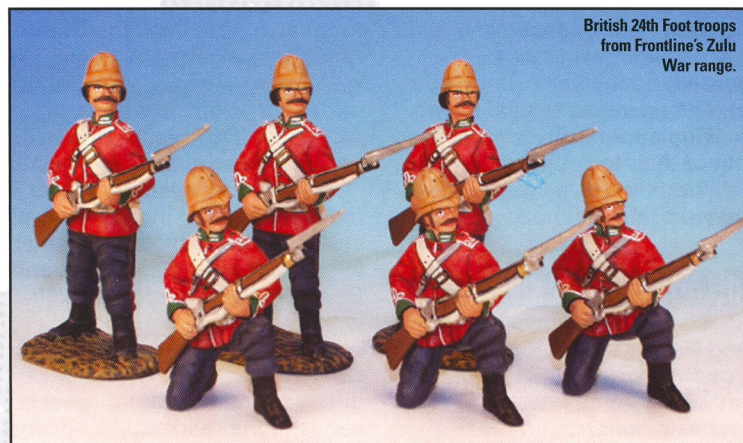
British 24th Foot troops from Frontline's Zulu War range.